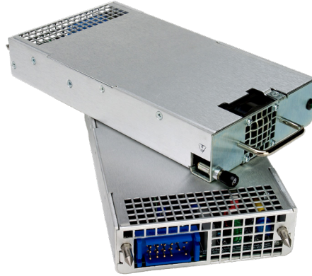
HML-SERIES POWER SUPPLIES